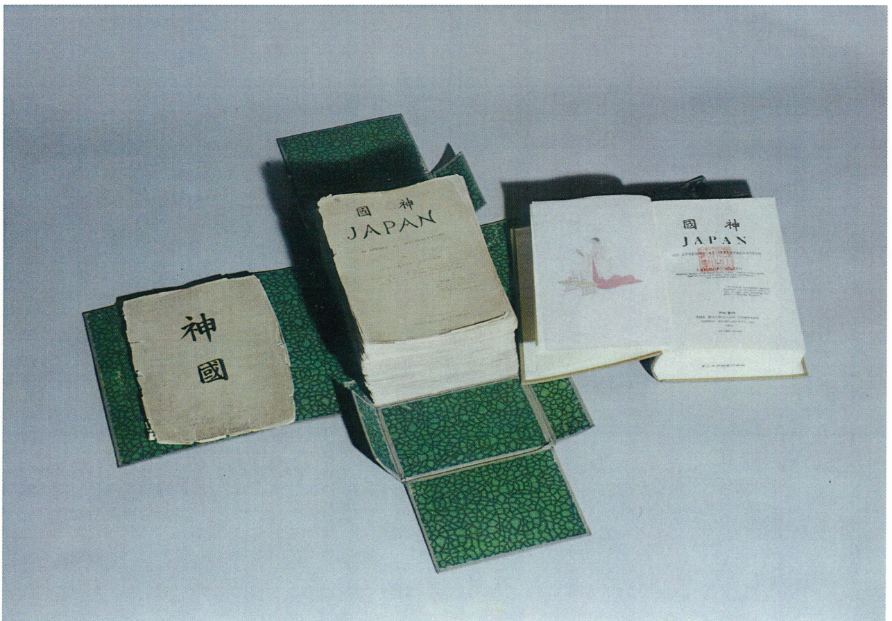
Hearn の晩年の大作「神国日本 Japan : an Attempt at Interpretation」の手書き原稿（トネリコ紙） （インターネットでも見ることができる）