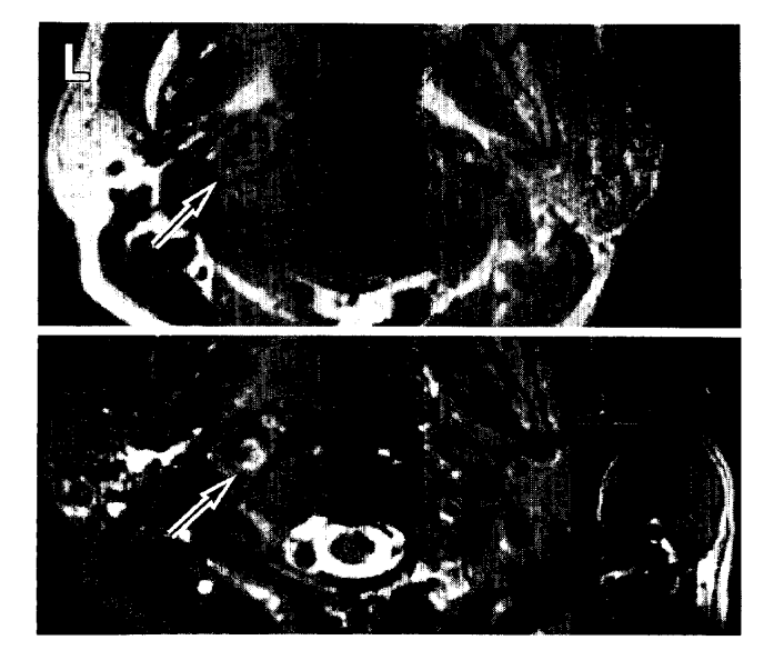
Fig. 3 T_1 - (upper) and T_2 -weighted (lower) magnetic resonance images at admission showing a high intensity lesion (arrow) in the arterial wall of the left internal carotid artery.

paralysis caused by spontaneous carotid artery dissection. Arch Neurol 40: 653–654, 1983