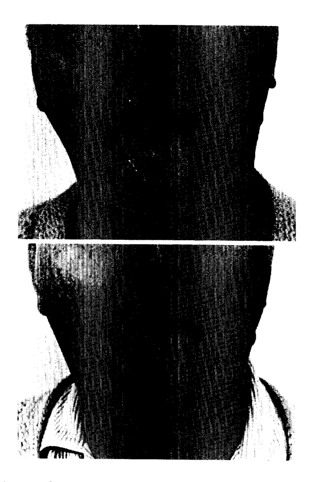
Fig. 1 Photographs showing deviation of tongue to the left at admission (upper), and at 6 weeks after onset when symptoms disappeared (lower).

may result from vascular lesions in the neck, such as aneurysm, dissection, or kinking of the external ICA. The mechanism of hypoglossal nerve paresis was apparently by nerve stretching and compression due to the abnormal vascular lesions.<sup>1,3,4,6)</sup> Intraoperative observation in one case found that the hypoglossal nerve was compressed by the tortuous ICA against the sternomastoid branch of the occipital artery.<sup>6]</sup> Another case with focal enlargement and tortuosity of the ICA on MR imaging also supports this hypothesis.<sup>4)</sup> In our case, the hypoglossal nerve paresis was the only neurological deficit, and dynamic changes were observed in the ICA on angiograms and MR images in the vicinity of the C1-2 vertebra. In this region, the hypoglossal nerve generally changes course and becomes superior to the ICA, below the posterior surface of the digastric muscle. The nerve then loops around the occipital branch of the external carotid artery. The cranial nerves and the sympathetic nerve do not adhere tightly to the ICA in this region. We think that local changes in the dissecting ICA was involved in the nerve paresis, and the kinking of the ICA may have